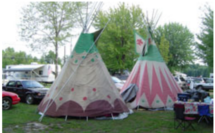
The Native Sons and Daughters have arrived.