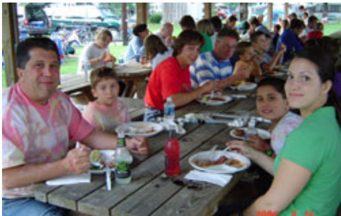
Dads and Families enjoy a meal with the kids