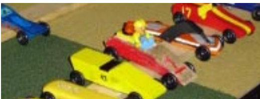
Pine Car Results Inside!!!!