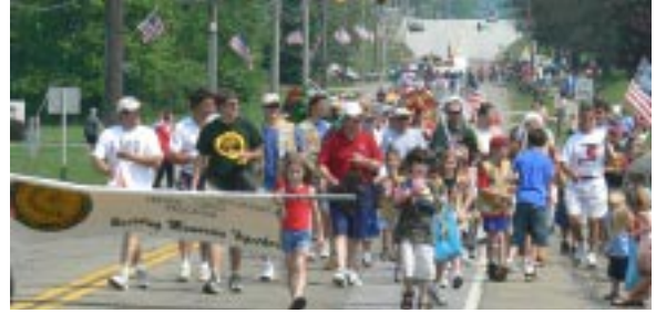
Broadview Hts. Memorial Day Parade